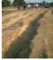
No all weather road